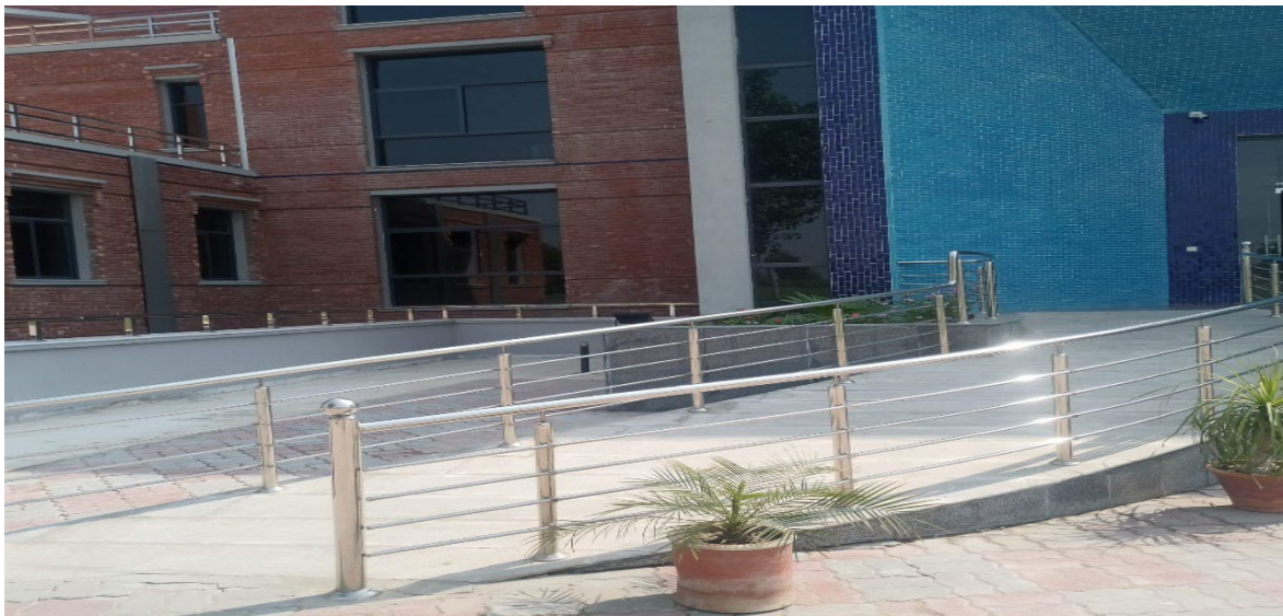
Ramps Provided for handicapped Peoples to easily access to Building