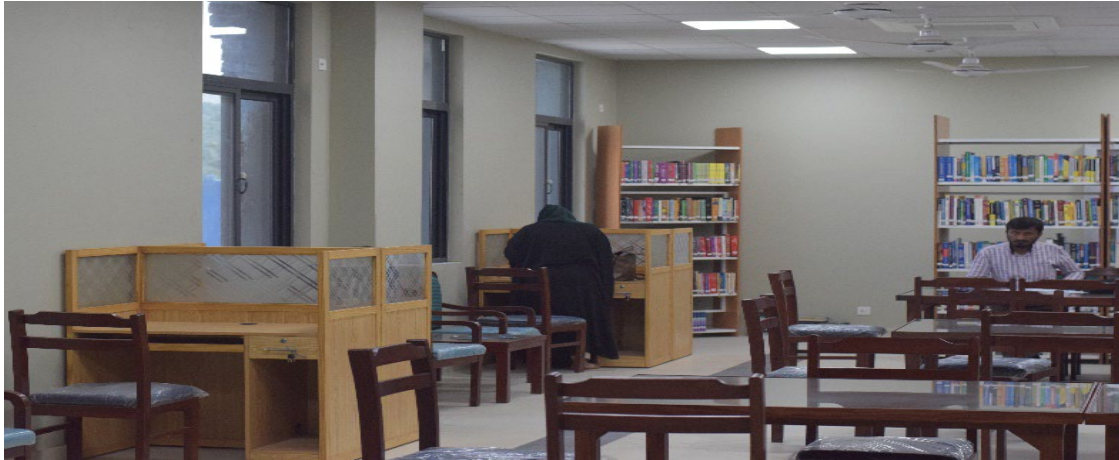
Ground Floor access to Library, especially for handicapped (Air University, Multan Campus)